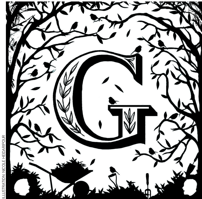
ILLUSTRATION: NICOLE HEIDARPOUR